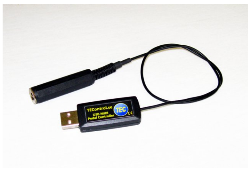
TEControl USB MIDI Pedal Controller User Guide